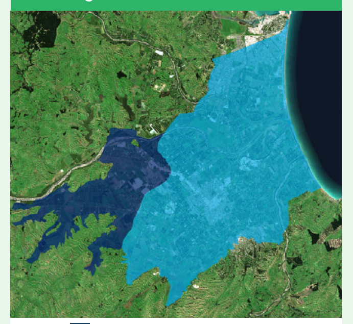
Heretaunga Plains unconfined aquifer