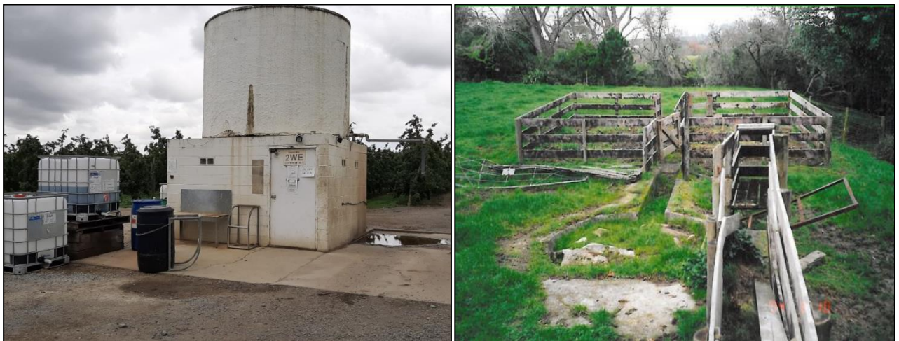
Figure 1. Do not remove silt from areas surrounding chemical storage sheds and filling stations, or sheep yards, particularly those with known historic sheep dips.